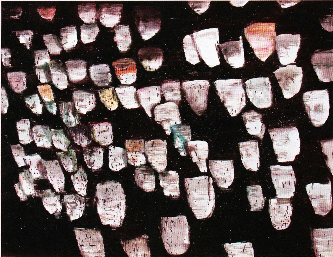
Sooner or Later, 2013, oil on canvas, 170 x 220cm